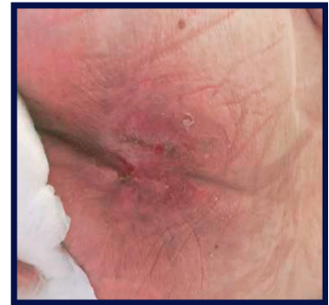
Day 10 of treatment

“The NEXA NWPT System is an excellent product. It has the advantages of being simple to use and inexpensive when compared to other products. Overall, every nurse enjoyed using the NEXA System and the patient, who had experience with other NPWT systems (and hated the thought of using it due to to the alarm constantly waking her) was grateful for the fact the NEXA System did not wake her once, the therapy pump noise did not disturb her in the least and the wound is certainly in a healing state.”