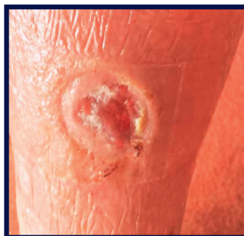
Day 19 of treatment