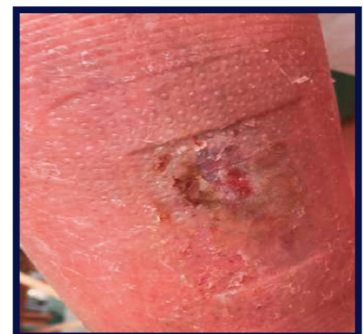
Day 39 of treatment

"These case studies were important for three reasons. The simplicity of use, effectiveness of the treatment and associated cost which are all important to modern wound healing.