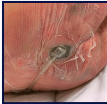
NEXA Dressing in situ