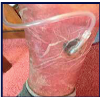
NEXA Dressing in situ

The wound size decreased markedly over the treatment period. At day 39 the wound was too small to continue with the Nexa System. The wound progressed to full closure within the next week using standard wound care.